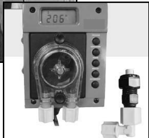
DR-2000™ Automated Air Deodorizer & Spray Tip