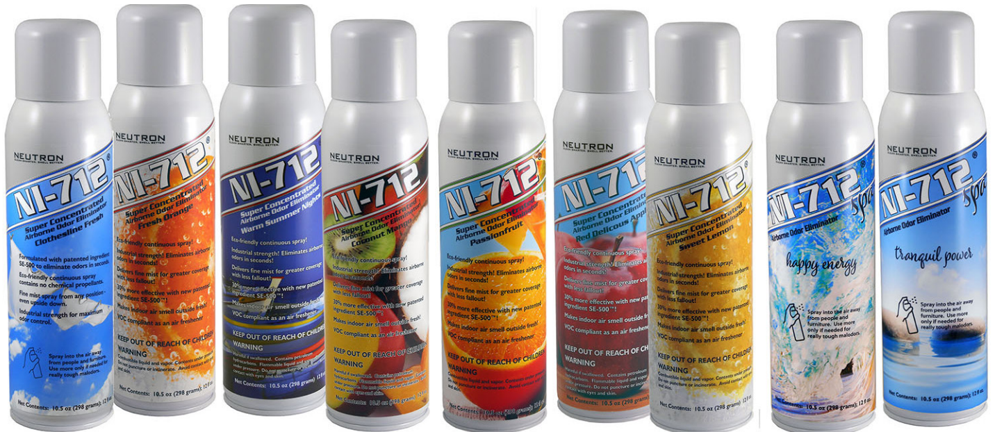
9 cans (12oz) per case

Clothesline Fresh - crisp and fresh. Like perfectly laundered and sun dried cotton with a hint of wildflowers. #127968